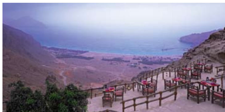
Sense on the Edge