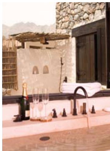
Pool Villa Bathroom